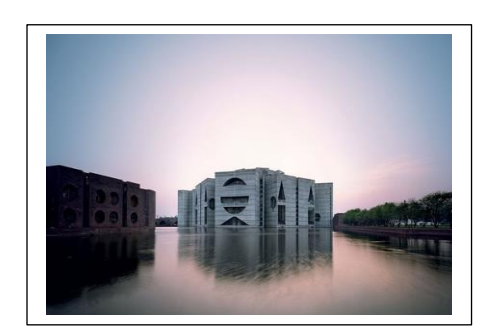
Parliament Building, Dhaka