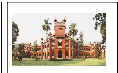
Curzon Hall, Dhaka University