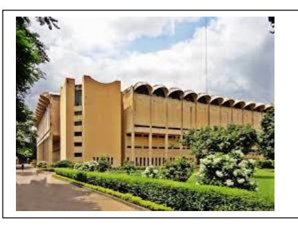
Bangladesh National Museum