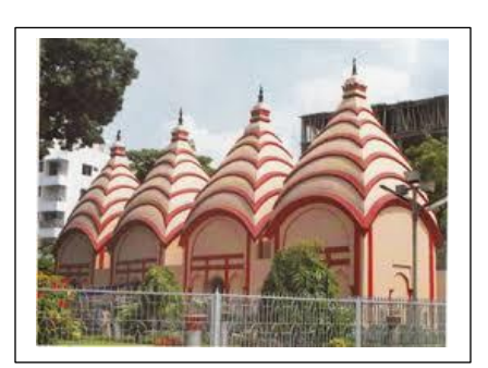
Dhakeshari Temple, Old Dhaka